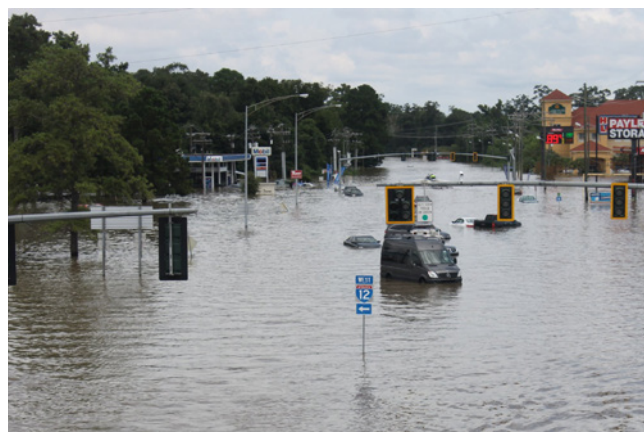
Flooded businesses in Baton Rouge, LA, August, 2016.

FLASH has been developed by researchers from the NOAA National Severe Storms Laboratory and the University of Oklahoma/NOAA Cooperative Institute for Mesoscale Meteorological Studies in Norman, Oklahoma. This research is described in a paper accepted for publication entitled, "The Flooded Locations and Simulated Hydrographs (FLASH) project: Improving the tools for flash flood monitoring and prediction across the United States."