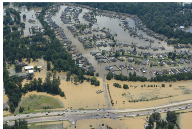
Aerial image showing flooding in Louisiana. August 14, 2016.